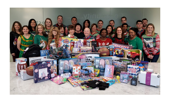
Employees of West Financial Services, Inc. pictured with toys purchased for Toys for Tots in 2019.

Employees are encouraged to record their volunteer hours on the company's intranet. Once submitted, the employee is entered into a monthly prize drawing.