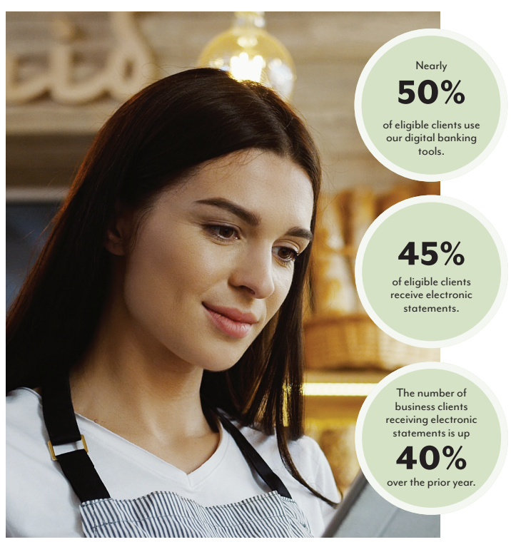
Data as of December 31, 2020