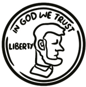
The penny with President Abraham Lincoln