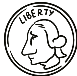
The quarter with President George Washington